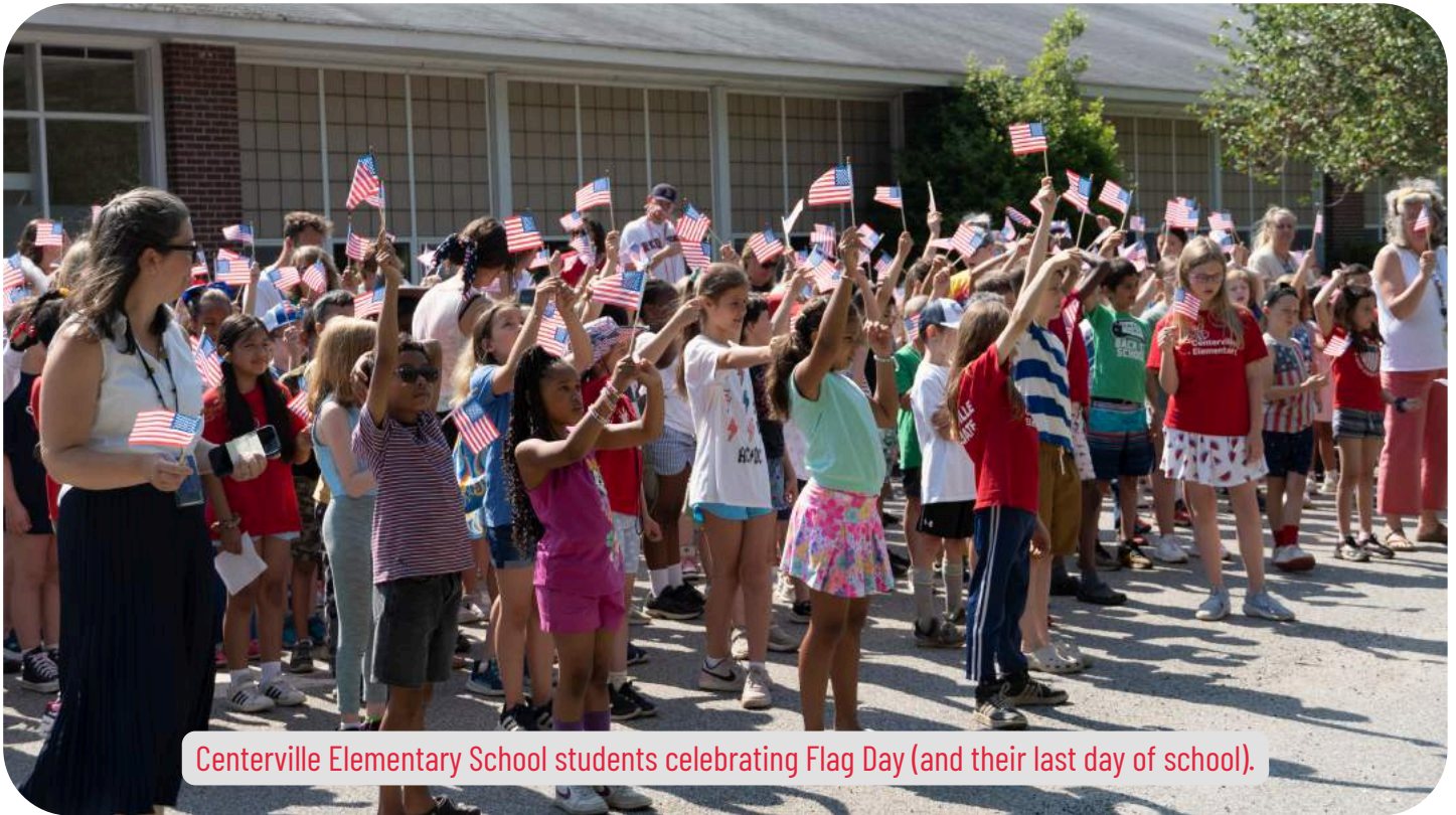
Centerville Elementary School students celebrating Flag Day (and their last day of school).