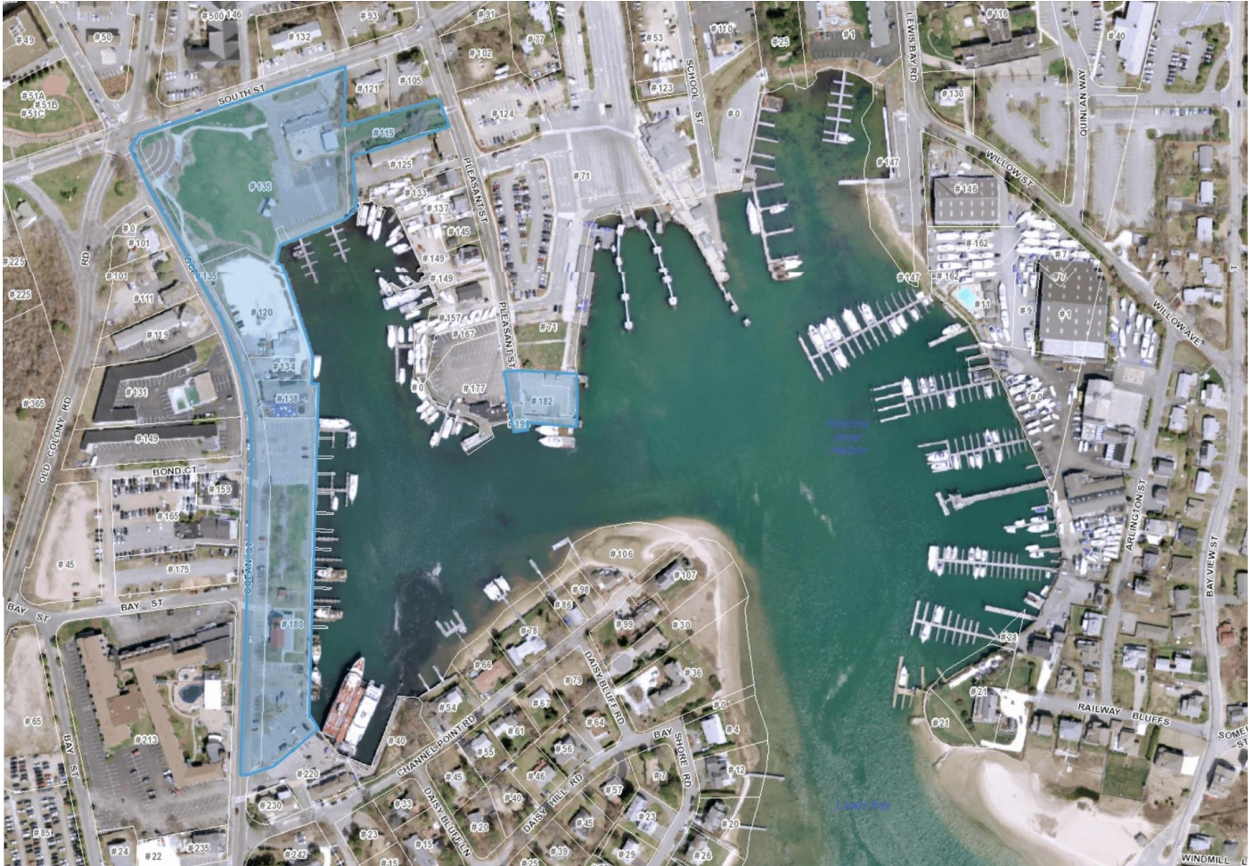
Map of Land Surveying Areas (shaded blue)