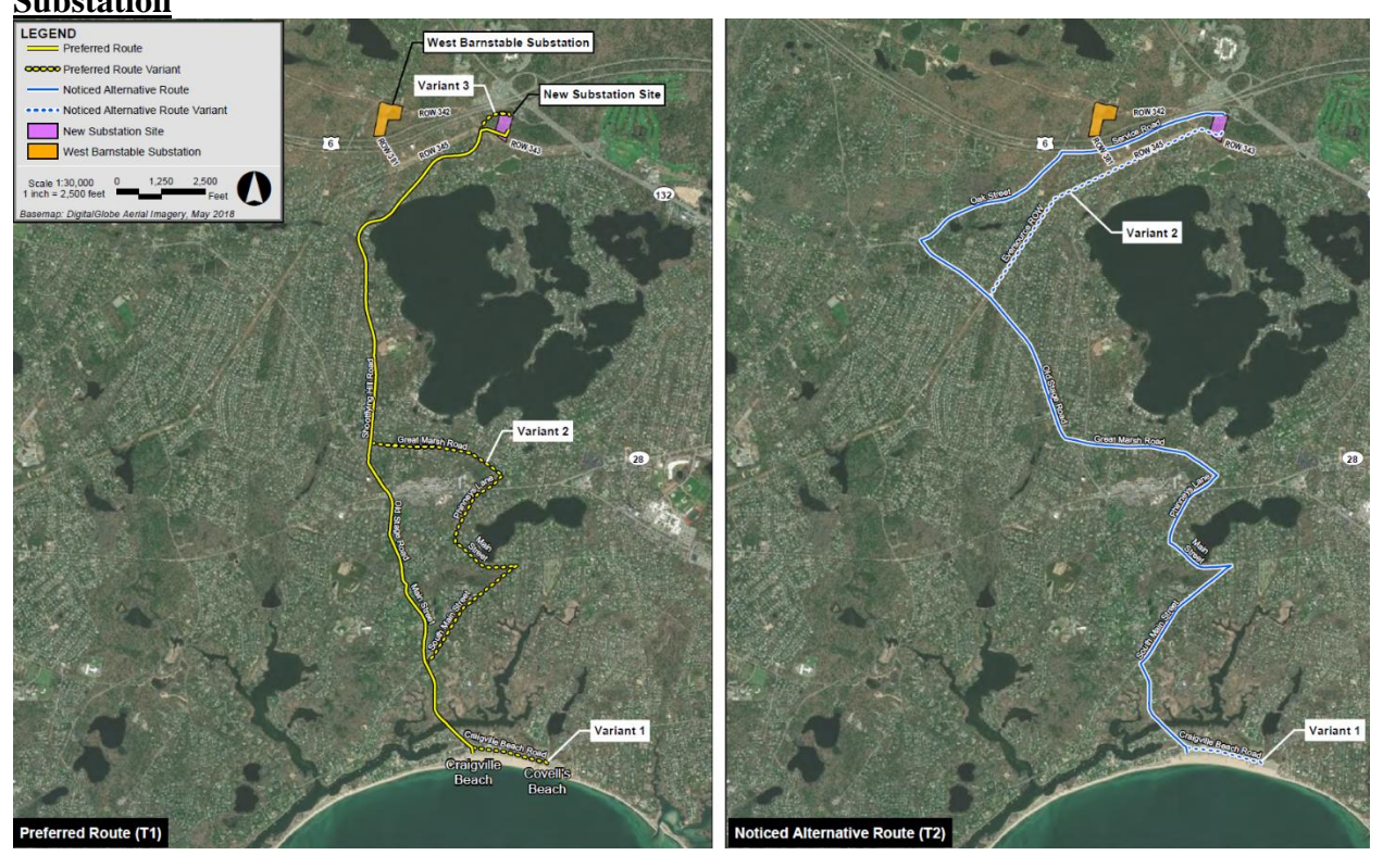
<u>Figure 2: Vineyard Wind Connector 2 – Onshore Routes, Landfall to New Onshore Substation</u>

A larger version of this figure is available at the following link: <a href="https://fileservice.eea.comacloud.net/FileService.Api/file/FileRoom/12183564#page=9">https://fileservice.eea.comacloud.net/FileService.Api/file/FileRoom/12183564#page=9</a>