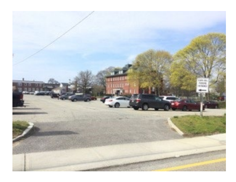
Town of Barnstable ADA Transition Plan