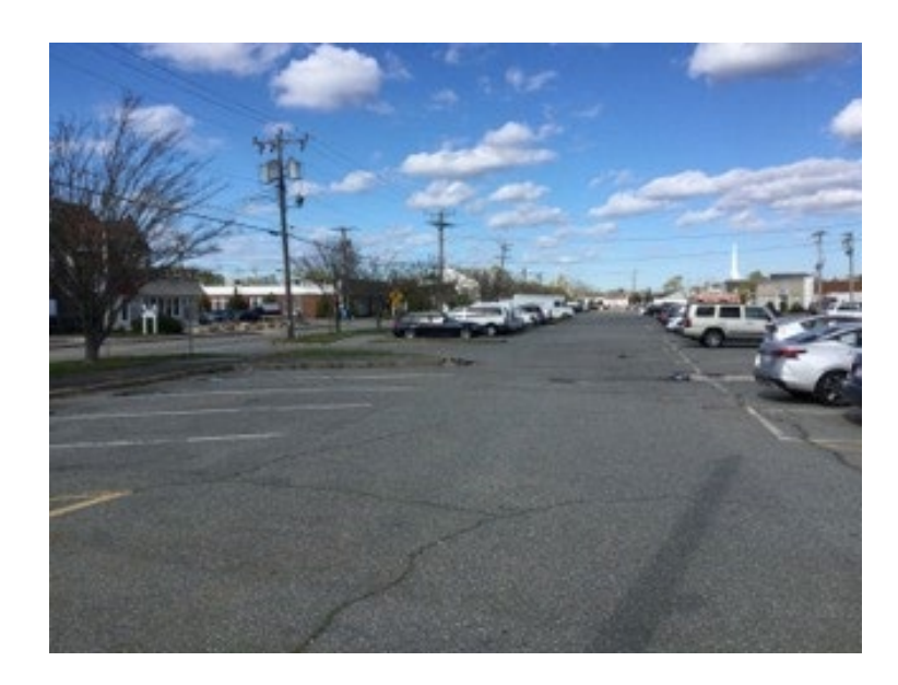
Town of Barnstable ADA Transition Plan