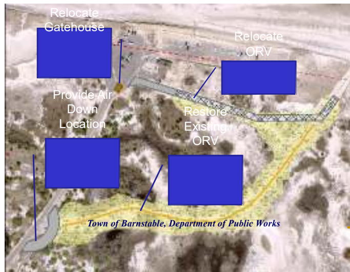
Town of Barnstable, Department of Public Works