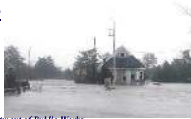
Town of Barnstable, Department of Public Works