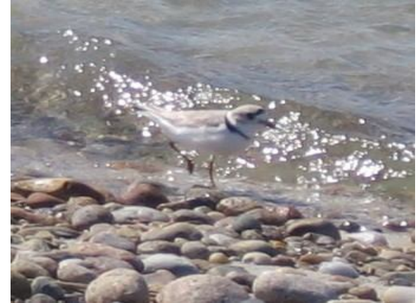
Piping plover on the point March 19 th

On March 19 th Sandy Neck staff confirmed reports that piping plovers had returned. Plovers were spotted feeding on Bodfish Beach just west of the Barnstable/Sandwich line and at the Point. By April the majority of our piping plovers had arrived and were beginning to nest. By the end of June we had located over 40 nesting pairs, and chicks were beginning to fledge (fly).