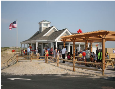
Bathhouse Opening Day

New and improved amenities include a heated outdoor shower, a picnic and play area, and a new walkway from the Bathhouse to the Marsh Trail. The parking lot has also been re-