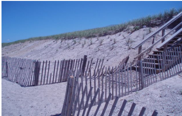
Nearly completed dune restoration in front of parking lot. The restored dune will act to buffer the parking lot from winter storms.

This spring, Mass. Beach Buggy Association and Boy Scout Troops 52, 54 and 80 worked with Sandy Neck Staff and Barnstable Division of Public Works to rebuild the dune in front of the public parking lot. Winter storms eroded a significant amount of the dune in front of the parking lot and threatened to wash the lot away. Bathhouse construction offered a unique opportunity to relocate excavated sand to the front of the parking lot increasing the lot's protection from eroding Nor'easters. MBBA and the Scouts worked for several hours installing dune fencing to contain the material. Once in place, a front end loader dumped sand into the areas and dune grass was planted. Sandy Neck staff finished the projects by installing additional dune fencing that will naturally capture sand during the summer months. Thank you Troops 52, 54, and 80 and MBBA!