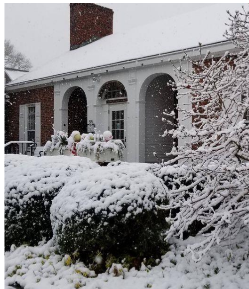
Centerville Public Library

Special services include on-going weekly and monthly programs, technical assistance, public computers, faxing, printing, photocopying, wireless access, digital literacy support, and homebound delivery. We engage our patrons through mailings of our Annual Report, quarterly newsletters, and ongoing publicity to newspapers, radio stations, email, and popular social media platforms. We also provide meeting space and outreach to local organizations and town officials.