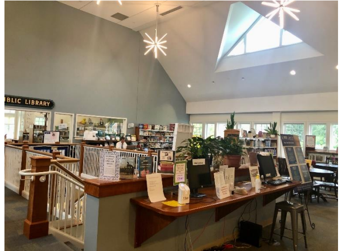
Osterville Public Library