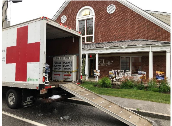
Osterville Library hosting monthly blood drives