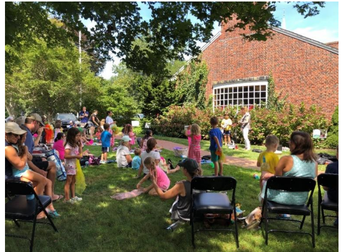
Centerville Public Library