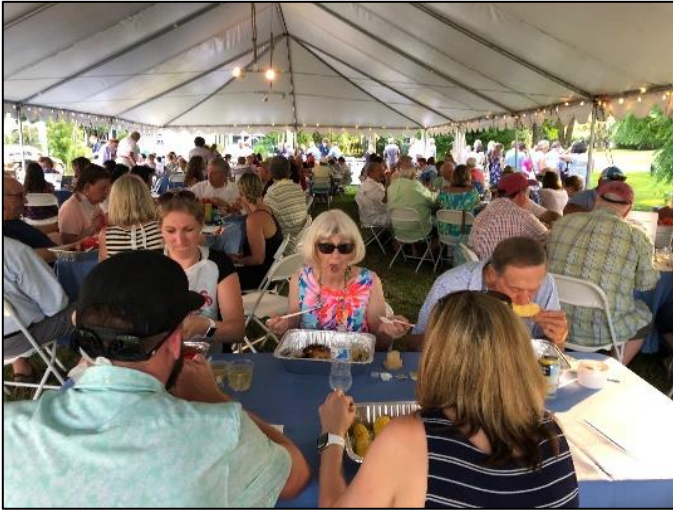
Osterville Public Library Social