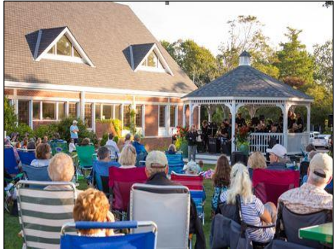
Osterville Public Library Social